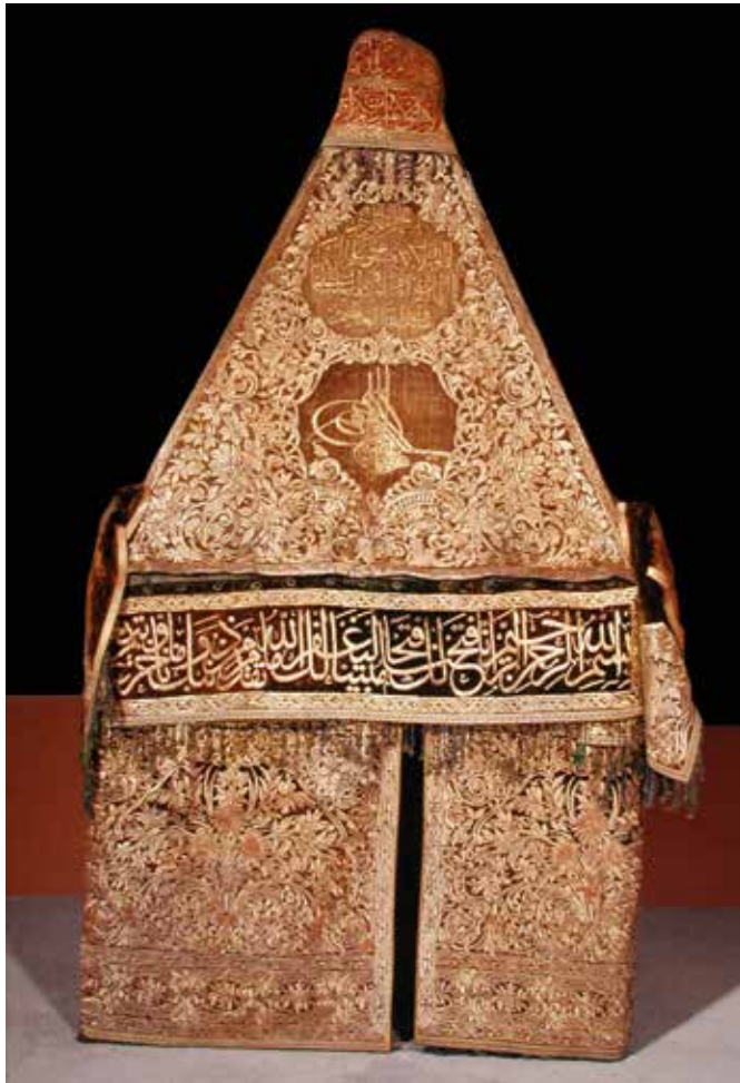
Photo: Tent of the surre caravan carrying presents from Istanbul to Mecca.